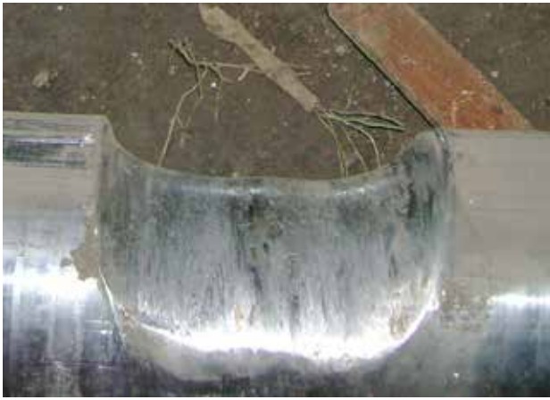
The standard hammerpin shows significant wear after 50,000 production tons.