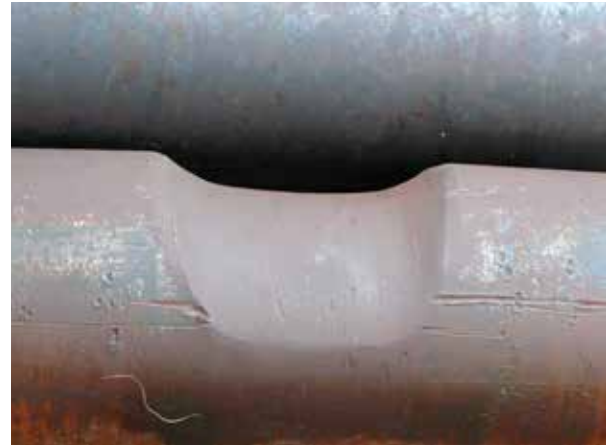
Metso LongLife Hammerpin's wear after 50,000 production tons is considerably less.